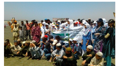
YouthCaN Activity. Read news on Page 2