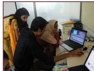
Participants of the workshop on Digital Storytelling in Classroom

These trainings helped them to improve their teaching and learning practices through interesting sessions and activities focusing ICT integration and collaborative learning approach. The educators discussed new ideas and shared experiences with other teachers and students around the world through iEARN forums. http://www.iearnpk.org/PD/Gallery_Highlights.htm