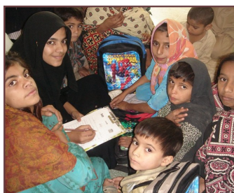
Children at the flood relief camps learning to draw with volunteers

Tahir Javed, Program Manager (English Access)